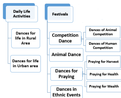
Figure 2. The sub-schema of festival dances and daily life dances

in rural(1) and the dances in urban (2). Dances for rural region depicts the scene of countryside, works on the fields and even the scenes from daily life activities with pasturing buffaloes, fishing and cultivation. In contrast, considering dances for urban areas is the scenes of the modern life to reflect the bad activities from the young generation. It extracts the dark background in the city to admonish their children (the adjacent generations). More importantly, almost all the dances regarding life of urban area is belonged to Kinh ethnic group.